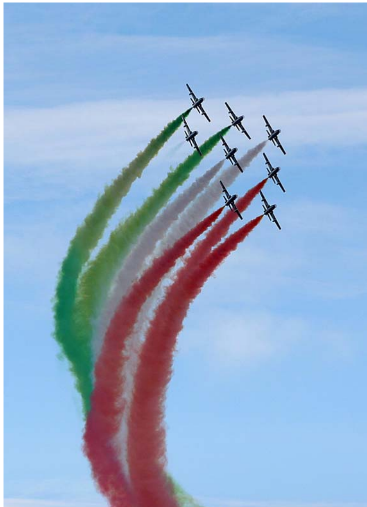
“FRECCIE TRICOLORI” FOR EUROPEAN CUP FINALE-ARTA TERME ZONCOLAN 2006